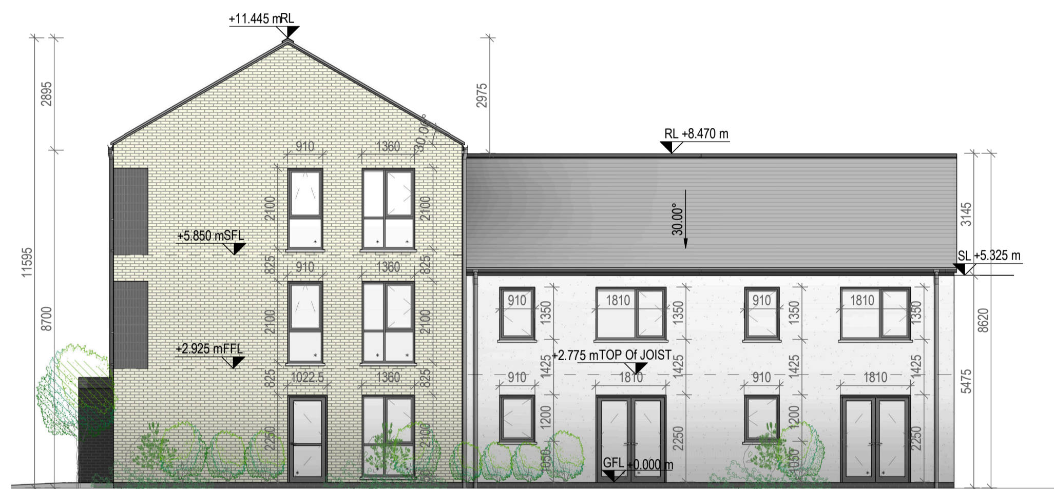
2 Rear Elevation 1 : 100

Apt.W no. 27-29 HT. B no. 26 HT. B no. 25