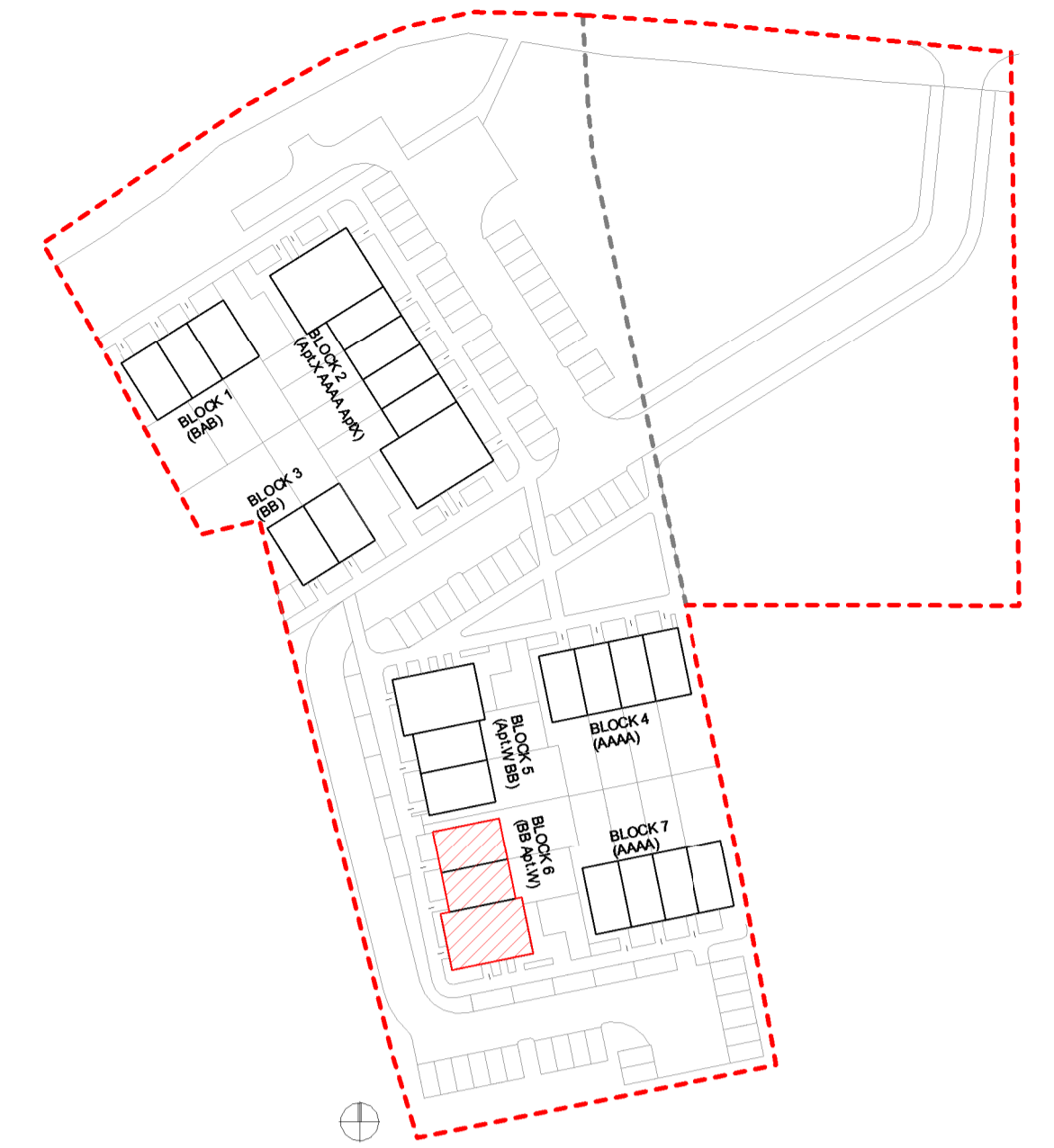
Key Plan 1 : 1000