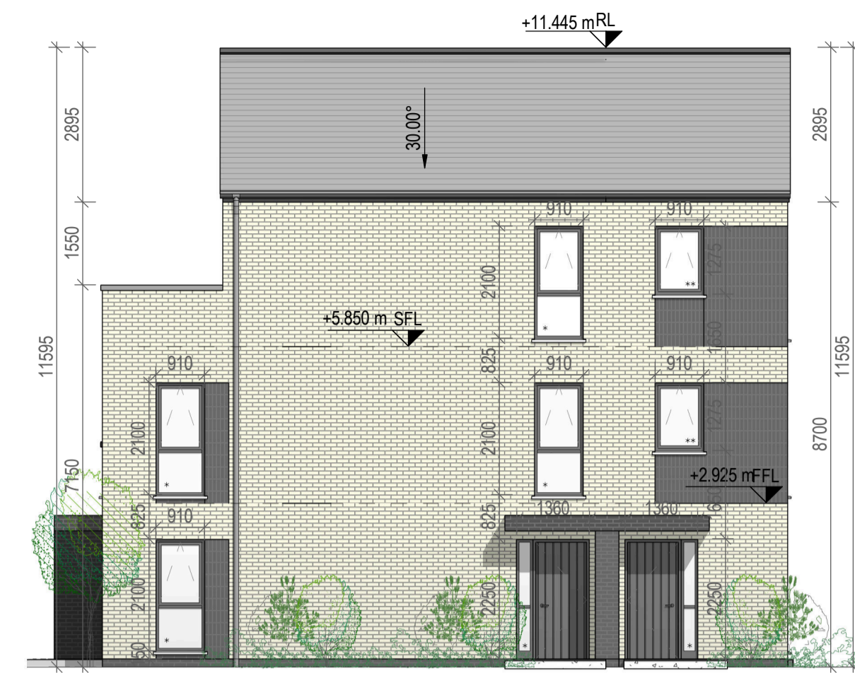
3 Side Elevation 1 1 : 100

HT. B no. 25 HT. B no. 26 Apt.W no. 27-29