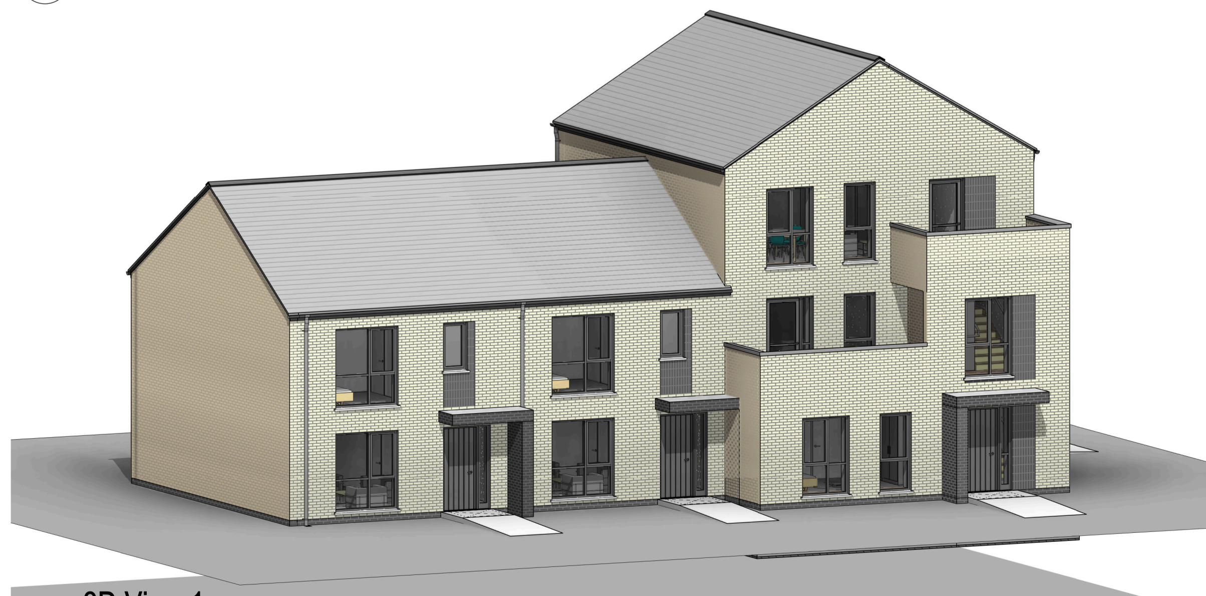
6 3D View 1