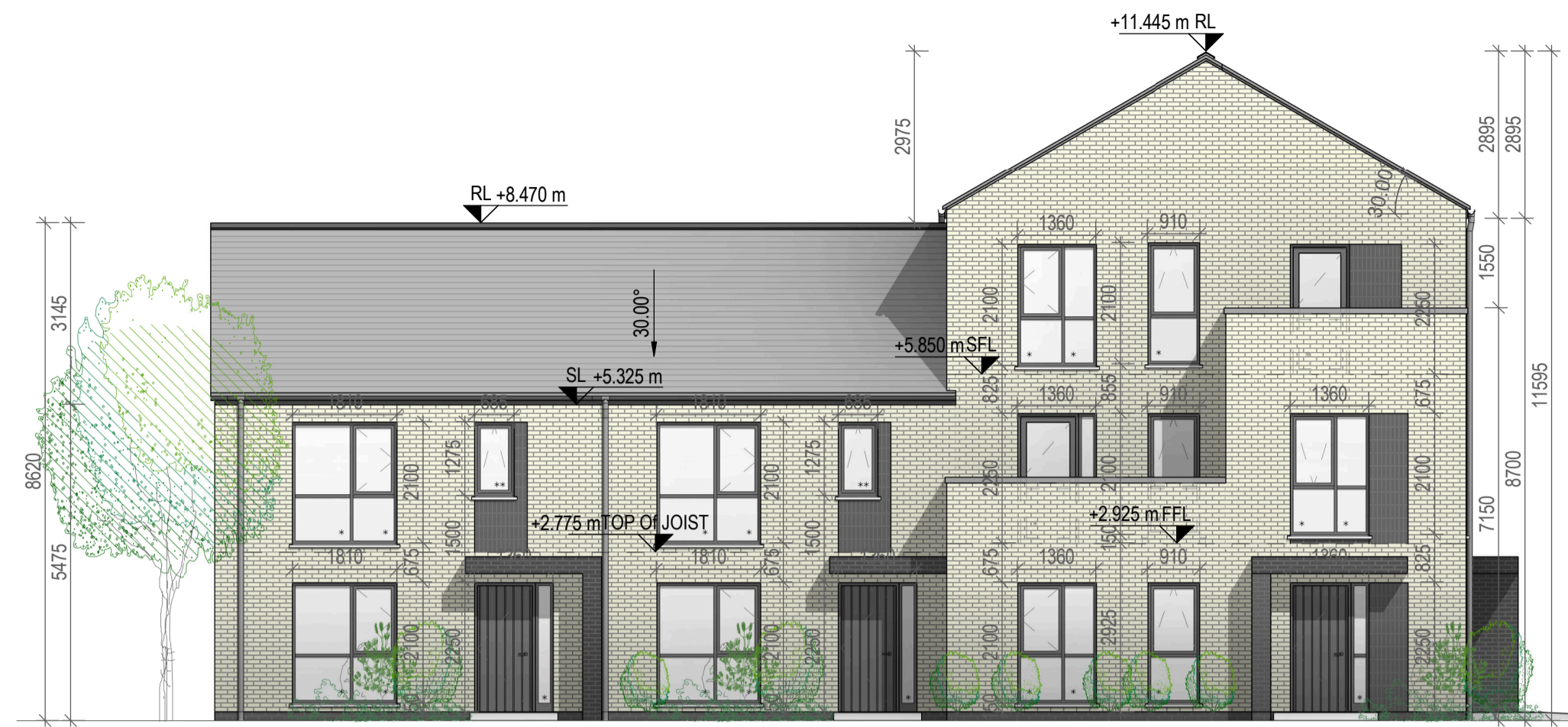
1 Front Elevation 1 : 100

HT. B no. 25 HT. B no. 26 Apt.W no. 27-29